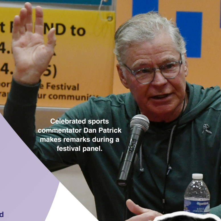
Celebrated sports commentator Dan Patrick makes remarks during a festival panel.

FESTIVAL ATTENDEES HEAR IT STRAIGHT FROM THEIR FAVORITE AUTHORS!