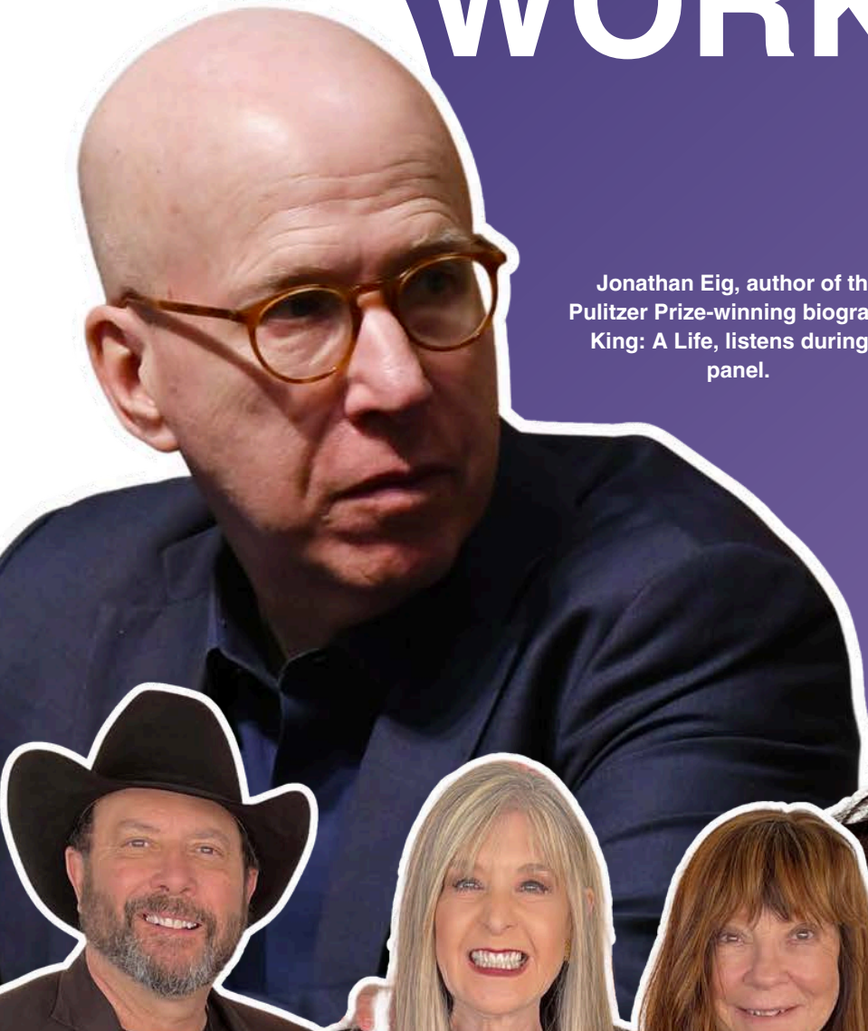
Jonathan Eig, author of the Pulitzer Prize-winning biography King: A Life , listens during a panel.