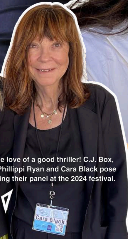
For the love of a good thriller! C.J. Box, Hank Phillippi Ryan and Cara Black pose following their panel at the 2024 festival.